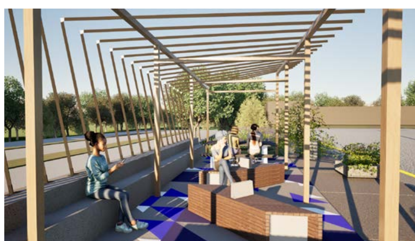
View From the Inside

The gateway signage will attract tourists to the new town by combining dynamic movement, art, and eye-catching design. This integration creates a focal point that draws attention and enhances the street's appeal, guiding visitors to explore the town's square. Additionally, it will serve as a memorable landmark, reinforcing the town's identity and inviting exploration.