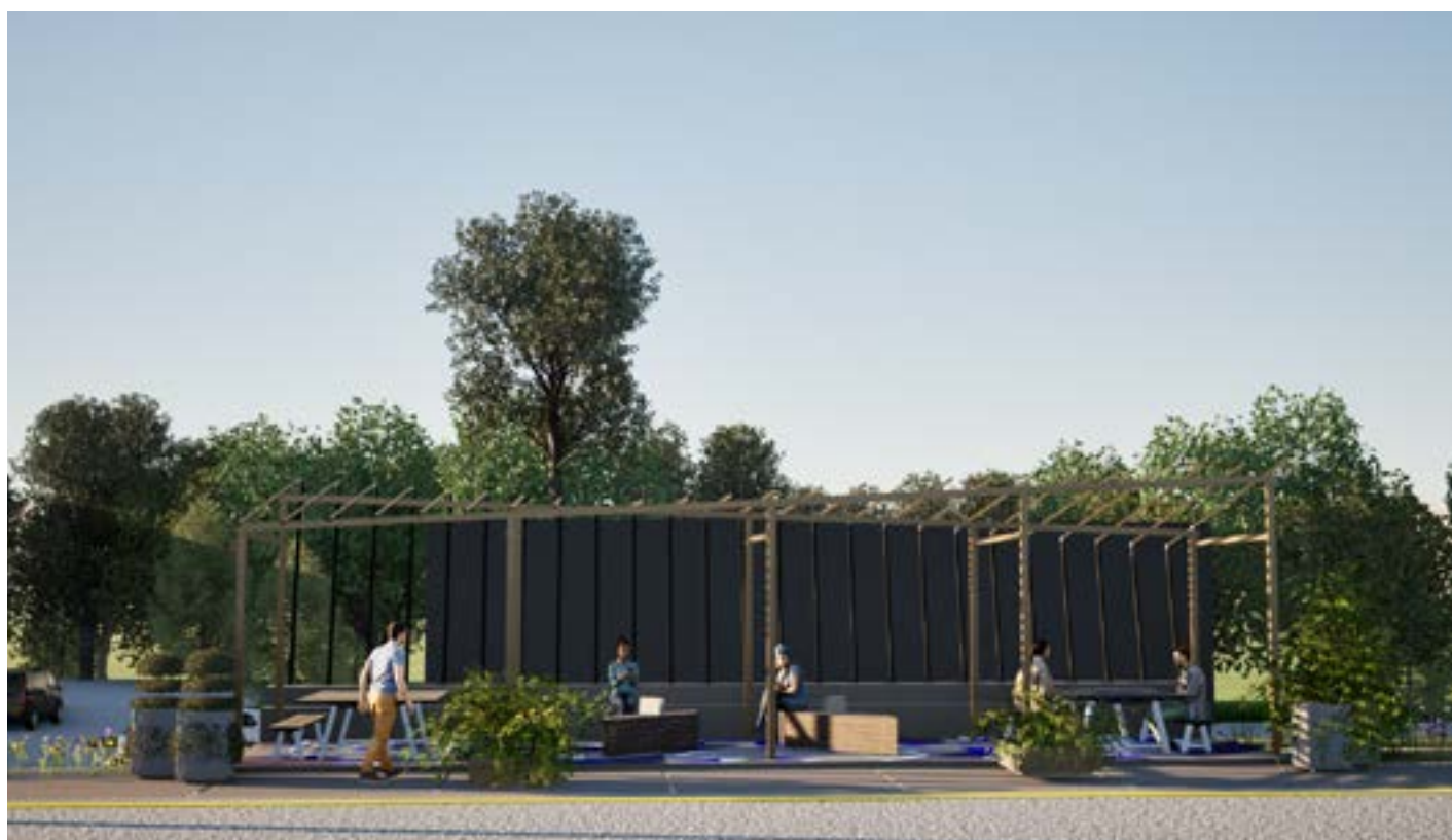
View From the Square

The pergola uses movement to help reflect the community's goals of moving towards a revitalized town square. While people pass the pergola it changes visually. It acts as a reminder of how Charlestown is a community in transition. This diagram shows how the shape of the pergola transitions as you move past it.